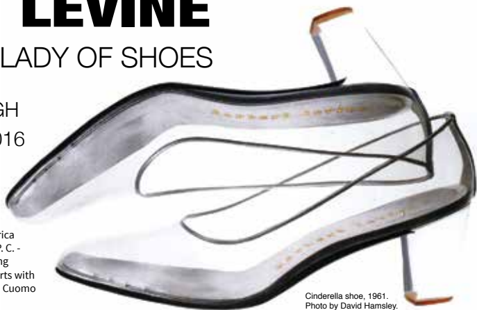
Cinderella shoe, 1961.